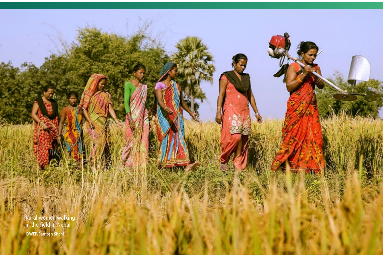
Rural women walking in the field in Nepal