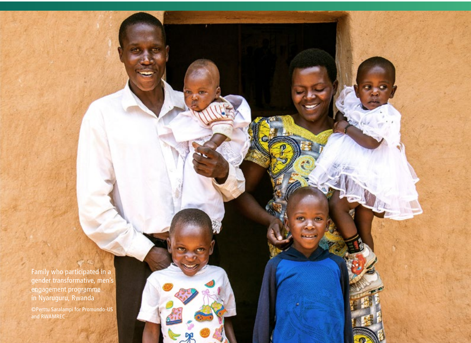
Family who participated in a gender transformative, men's engagement programme in Nyaruguru, Rwanda