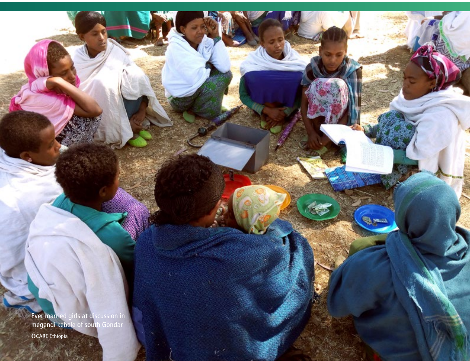
Ever married girls at discussion in megendi kebele of south Gondar