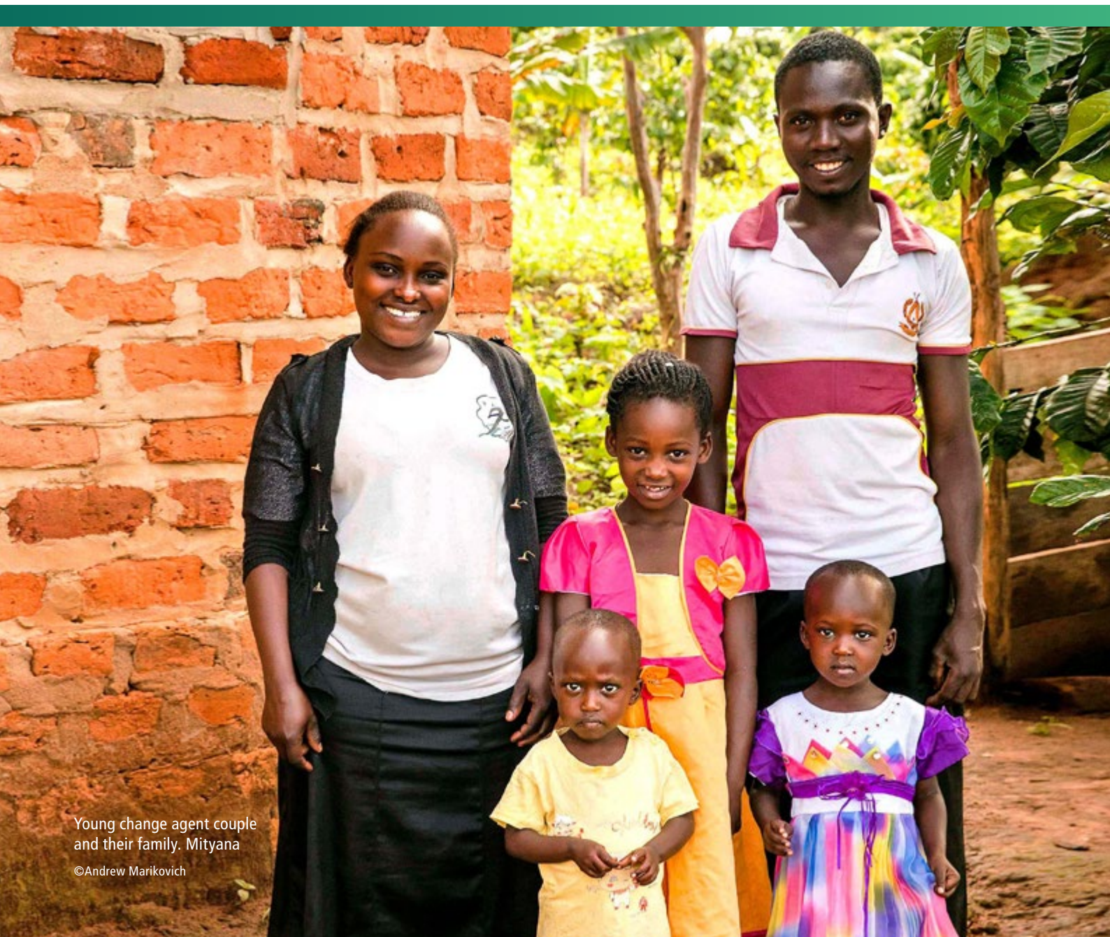
Young change agent couple and their family. Mityana