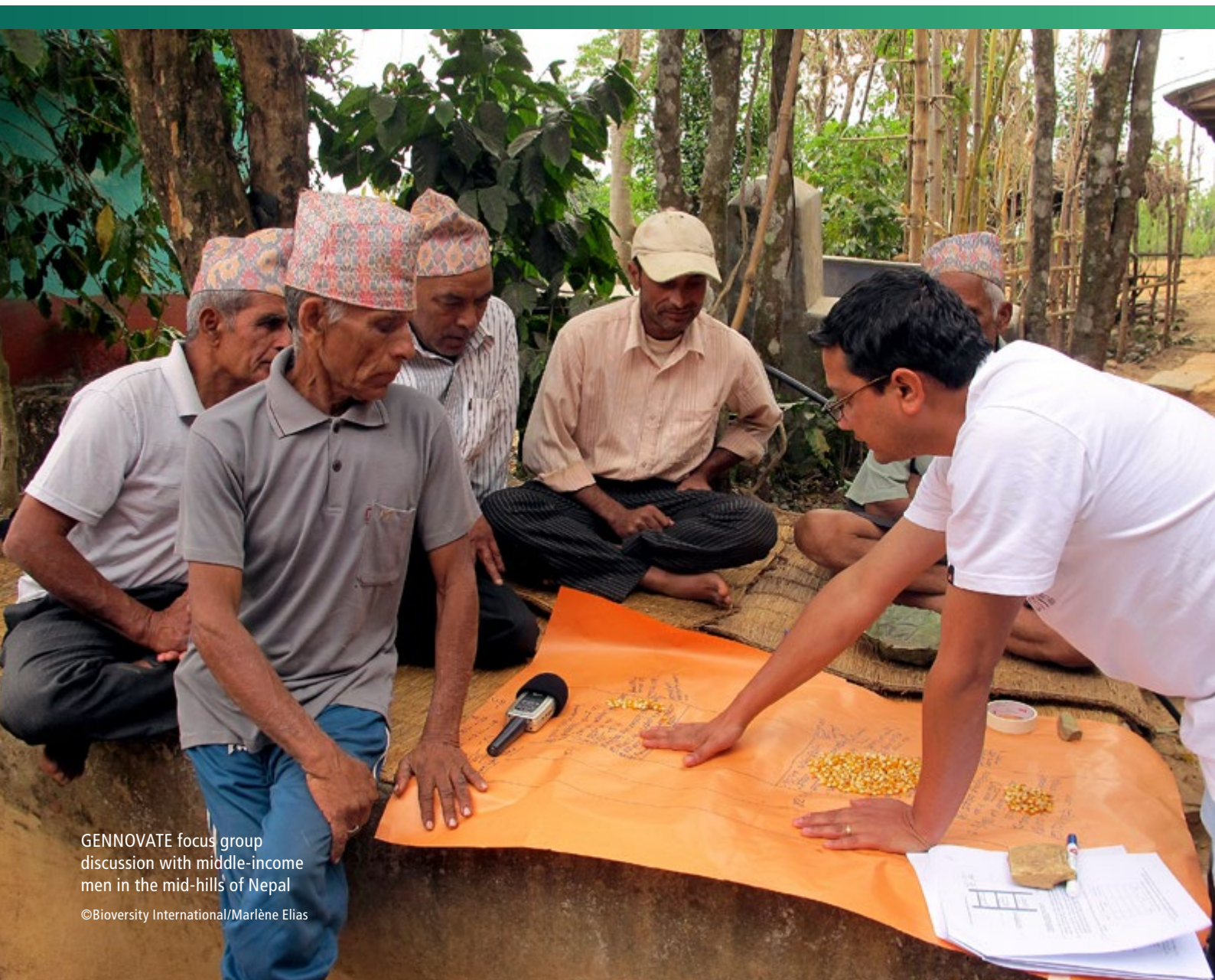
GENNOVATE focus group discussion with middle-income men in the mid-hills of Nepal