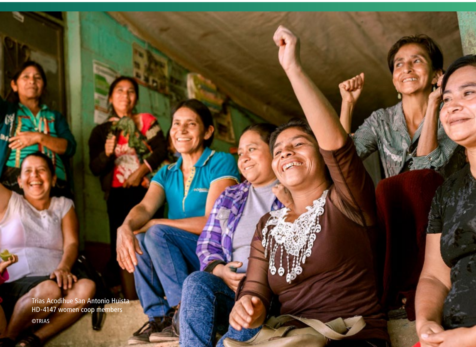
Trias Acodihue San Antonio Huista HD-4147 women coop members