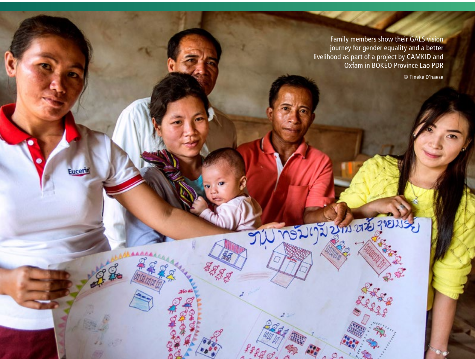
Family members show their GALS vision journey for gender equality and a better livelihood as part of a project by CAMKID and Oxfam in BOKEO Province Lao PDR